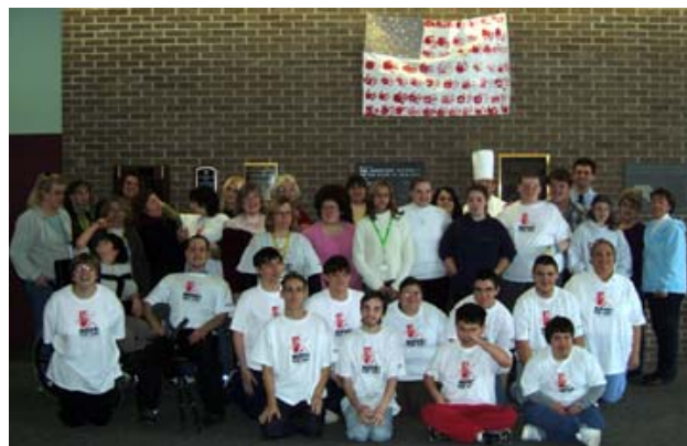
Herkimer County BOCES Students and Staff who participated in the Move for Life Program.

Together the worksites had over 500 employees participate in the Program. These employees logged more than 4500 hours of physical activity during the course of the Program; which translates into more than 180 days of physical activity.